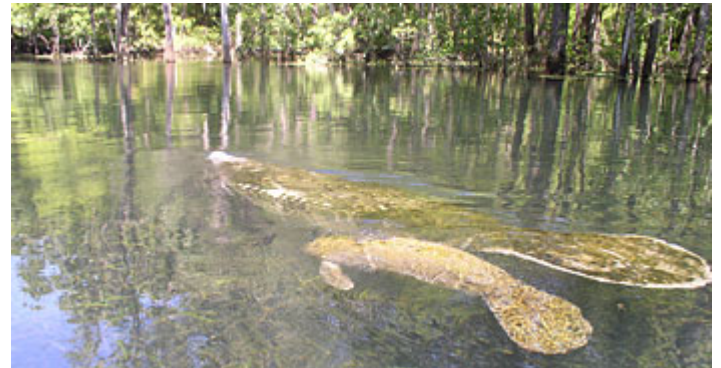
Manatee and calf – Ichetucknee River

The average flow of the Ichetucknee River is about 360 cubic feet per second. The main springs that make up the Ichetucknee Group are: Ichetucknee Head Spring, Blue Hole Spring, Mission Springs, Devil's Eye Springs, Grassy Hole Springs, Mill Pond Springs and Coffee Spring.